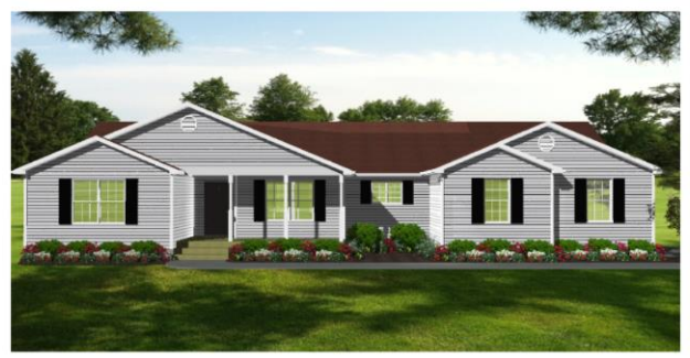
The Spruce Elevation