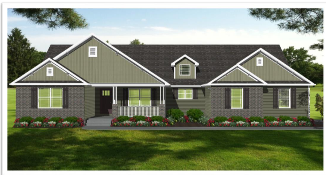
The Maple Elevation

Visit our website or call us today to speak with a sales person. Toll Free: 1-877-358-9199 www.sedgewickhomes.com