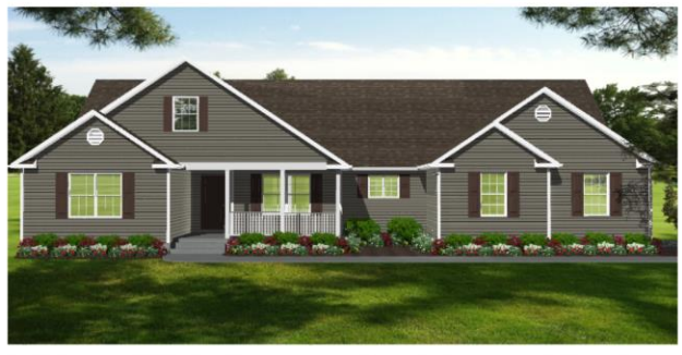
The Poplar Elevation