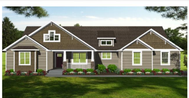
The Oak Elevation