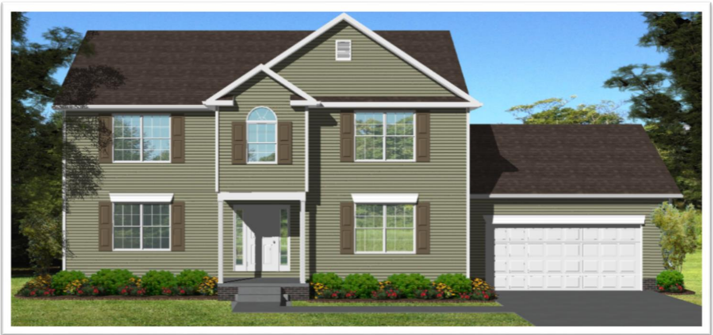
The Poplar Elevation