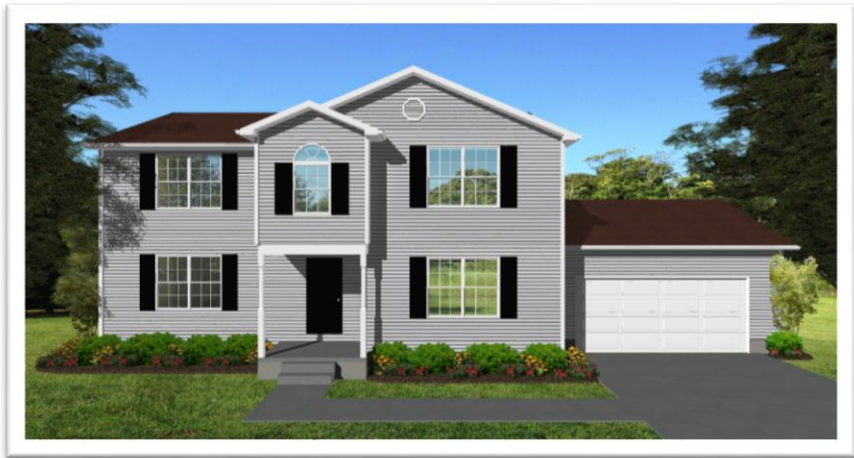
The Spruce Elevation

This drawing is for illustration purposes only. All dimensions are approximate and elevations may reflect optional features and colors. Square footage may vary by elevation.