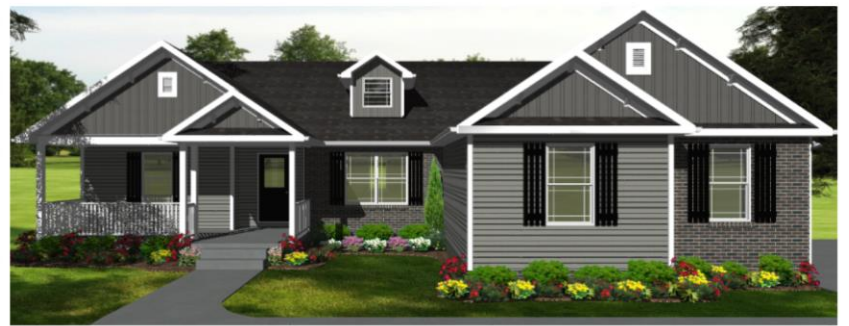
The Maple Elevation