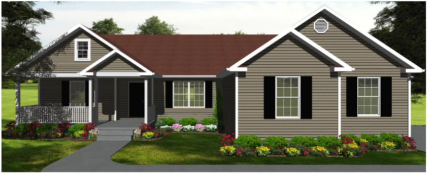
The Poplar Elevation