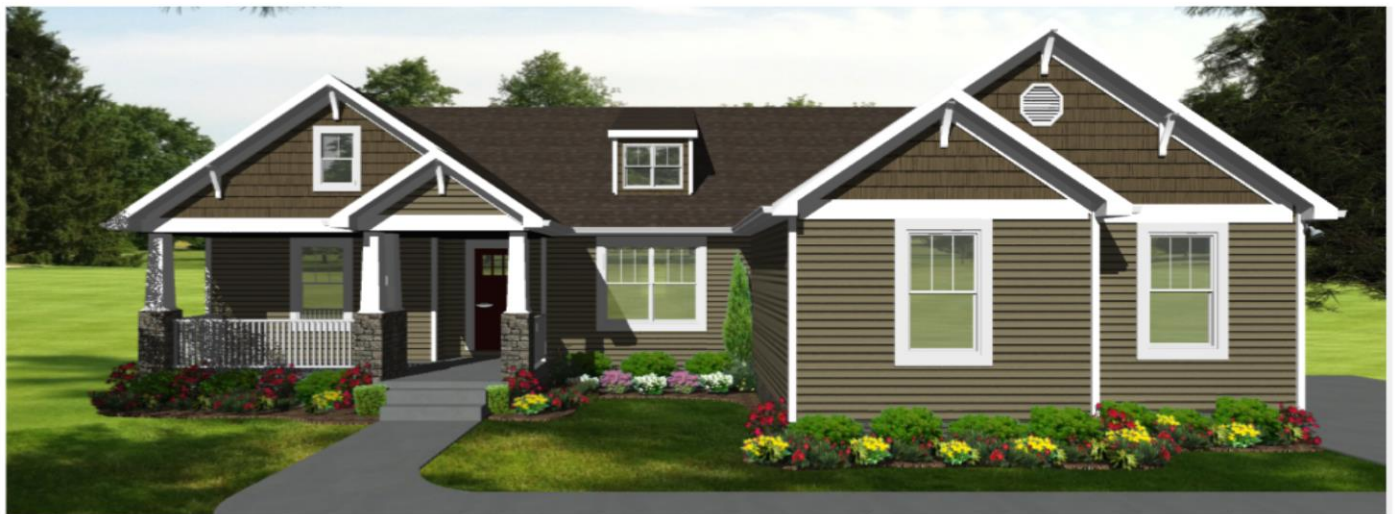
The Oak Elevation

Visit our website or call us today to speak with a sales person. Toll Free: 1-877-358-9199 www.sedgewickhomes.com