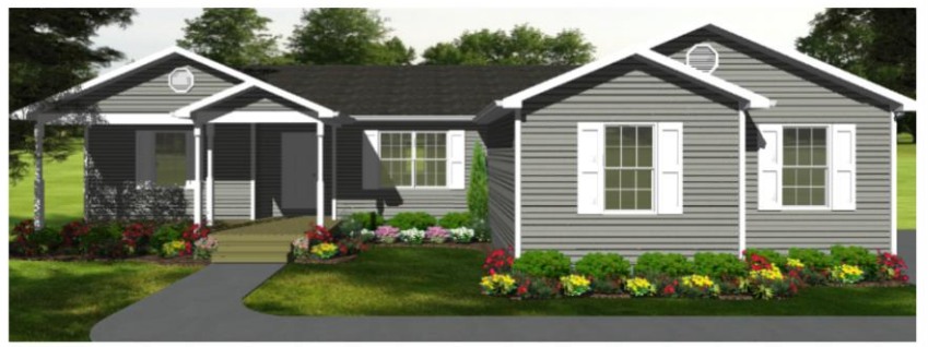
The Spruce Elevation