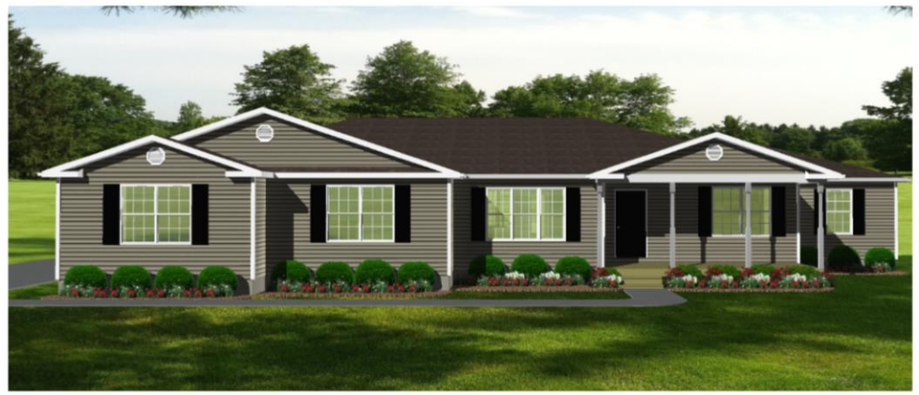
The Spruce Elevation

This drawing is for illustration purposes only. All dimensions are approximate and elevations may reflect optional features and colors. Square footage may vary by elevation.