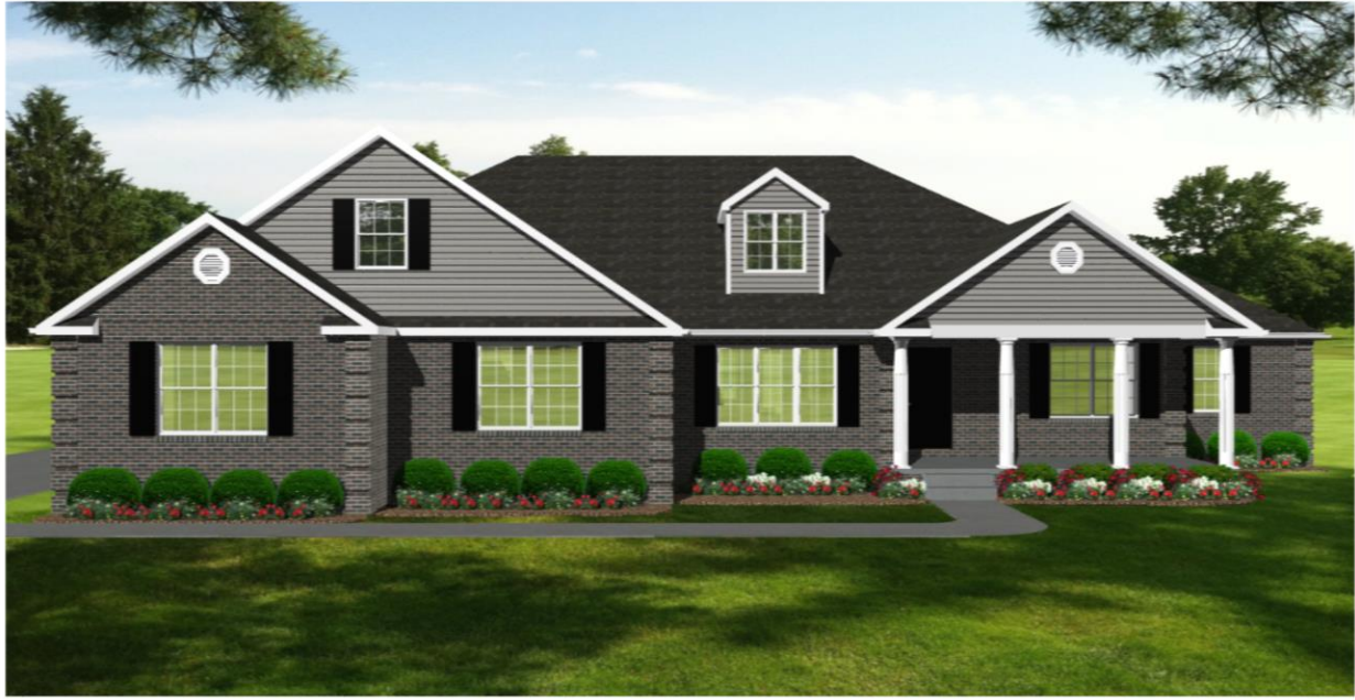
The Maple Elevation